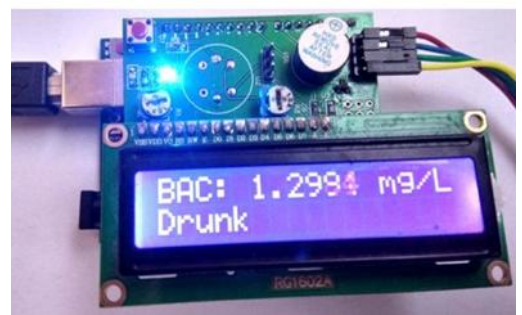
Fig 7.2 BAC level is high

When the Blood Alcohol Content (BAC) is more than the threshold value the LCD shows that the BAC level is not regular or high and the particular person is drunk.