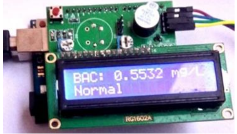
Fig 7.1 BAC level is normal

When the Blood Alcohol Content (BAC) is less than the threshold value the LCD shows that the BAC level is normal and the particular person is not drunk.